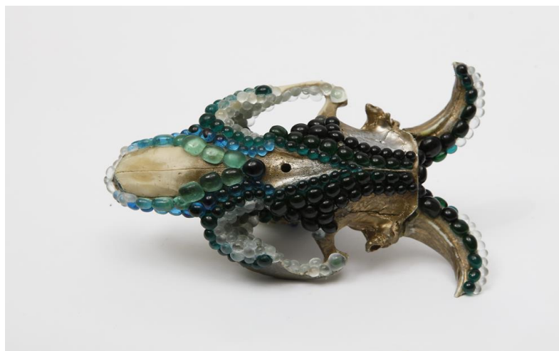
Figure 3. Inlay of organic matter with glass “Prabanga” (“Luxury”). Aut. G. Markauskiene